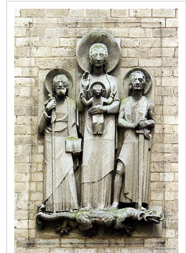
Relief an der Vorhalle von St. Georg, Köln