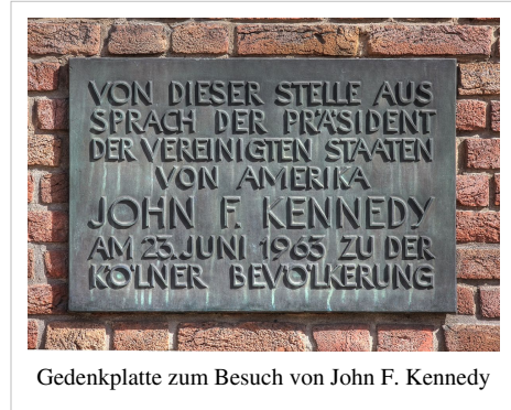
Gedenkplatte zum Besuch von John F. Kennedy